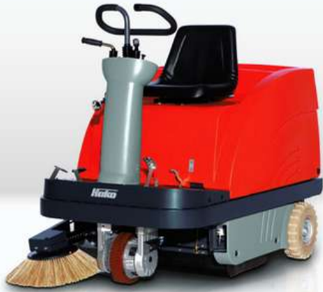
Sweepmaster B900 R