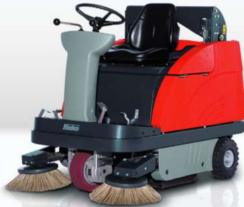
Sweepmaster B980 RH