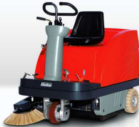
Sweepmaster B900 R