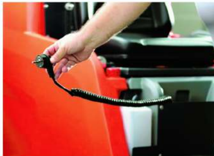
The on-board charger enables charging of the battery at any conventional 220/230 V mains outlet.