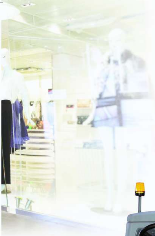
Optionally available: Warning systems and a working light ensure safe working in highly frequented areas.