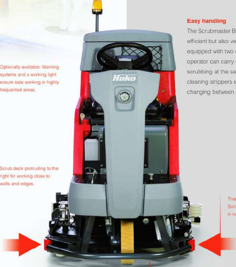
Thanks to its compact design, the Scrubmaster B120 R can also work in narrow aisles and corridors.