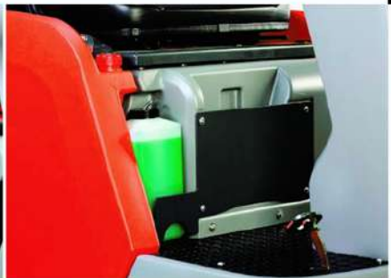
The on-board dosing system is completely integrated in the machine design and ensures that optimum quantities of cleaning detergents are added, depending on the amount of water used.