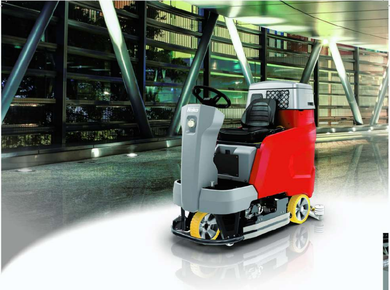
Technology provides efficient working